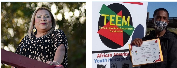
Pictures provided by Alliance Fund Grantee The Florence Project (left) and AALF Grantee Tucson Educational Empowerment for Minorities (right).